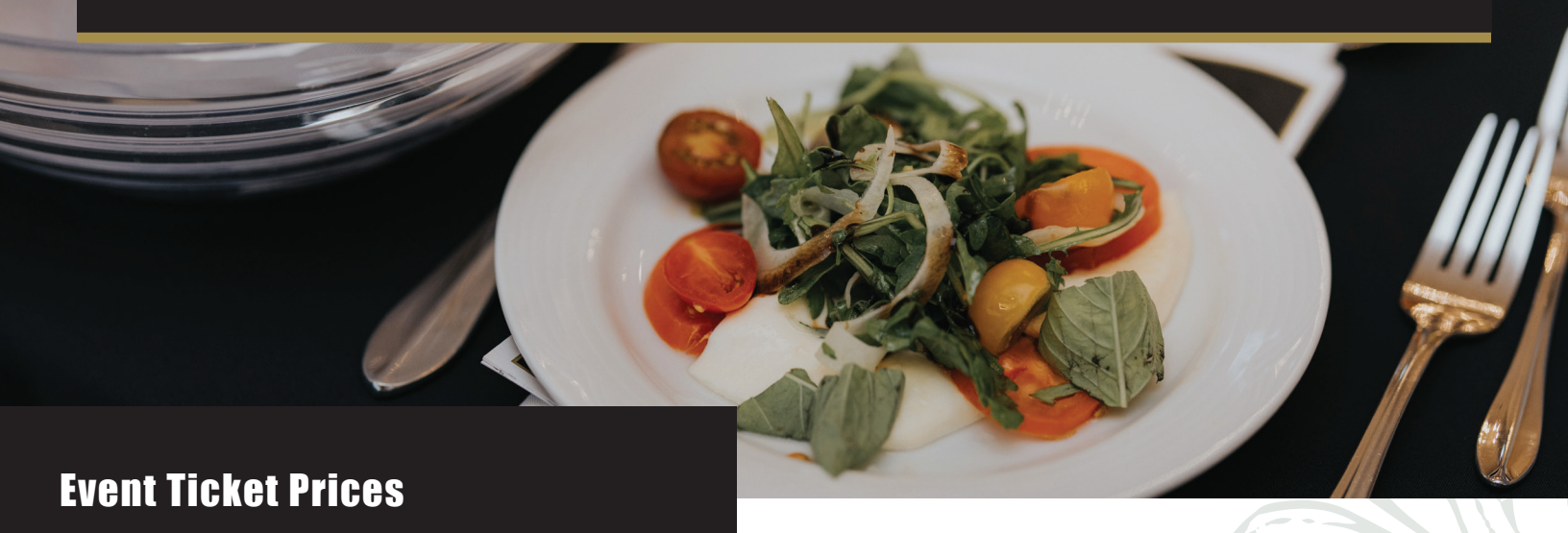
Table & Individual Ticket Sales

Dinner Ticket ......$185 Dinner Table .....$1,350 (8 seats)